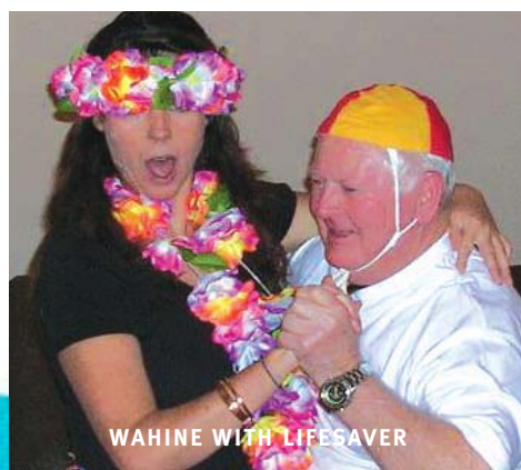
WAHINE WITH LIFESAVER