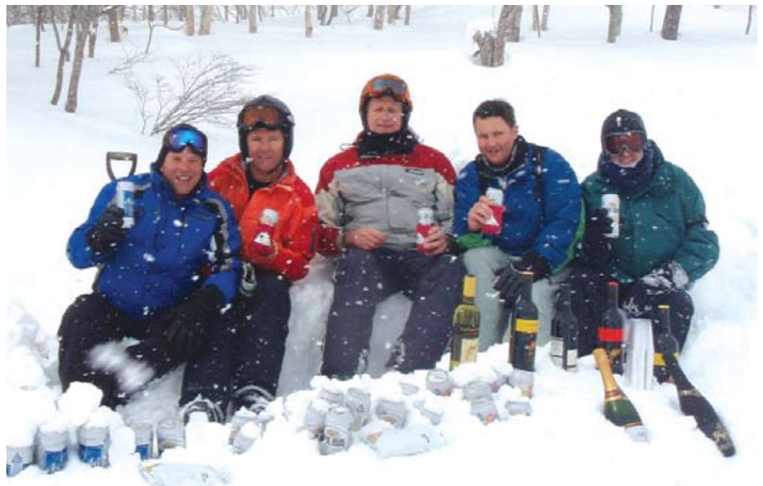
GUARDING THE SNOW BAR AT MOIWA

First stop was the Ronshan Hotel in Sapporo where people started trickling in a few days in advance of the official commencement in order to shop, sightsee and try to get used to a completely different way of life. Walking on the icy pavements was difficult and sometimes dangerous which led to a number of people purchasing different equipment for their safety. These included attachments with spikes set in rubber on the soles which slipped onto your shoes, or boots with retractable “claws”. At $10 - $20, they were an excellent investment.