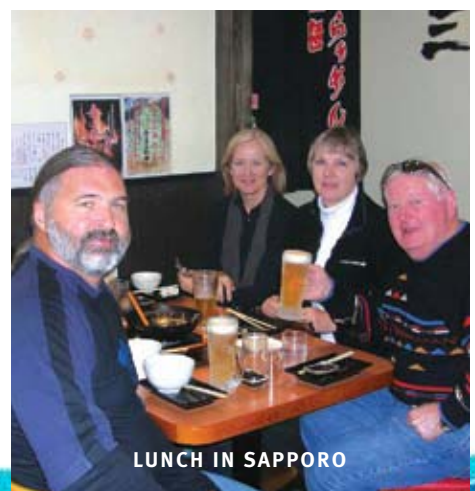
LUNCH IN SAPPORO