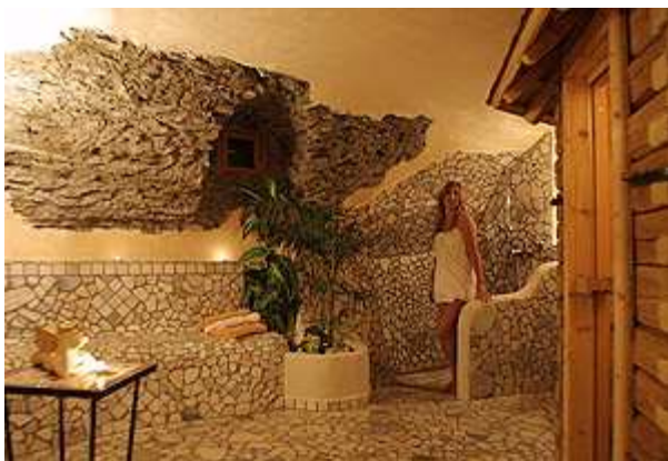
The Sauna and Wellness area