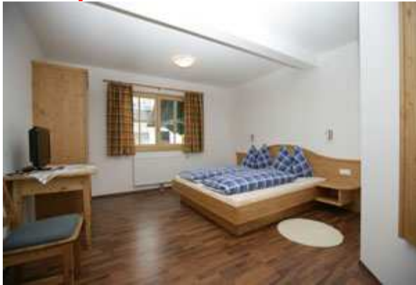
One of the double rooms